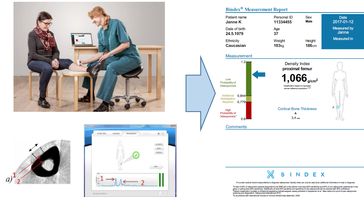
Figure 1: Ultrasound measurement (Bindex®) at proximal tibia. Tibial cortical thickness is measured, and a diagnostic parameter, Density Index, is calculated based on the cortical thickness and patient age, weight and height. Results sheet (on the right) shows the Density Index on a color scale, with classification with diagnostic thresholds as required by the International Society for Clinical Densitometry guidelines (ISCD).

conducted at 1/3 of the length of the tibia from the proximal head by trained study nurses (Figure 1). The device consists of a hand piece connected into the USB port of a laptop and an ultrasound probe. Two parameters were collected including cortical thickness at the proximal (Ct. Thprox) tibia and the DI. The method for cortical thickness measurement has been validated and can be considered as accurate method of osteoporosis assessment as comparing to axial DXA 9 .